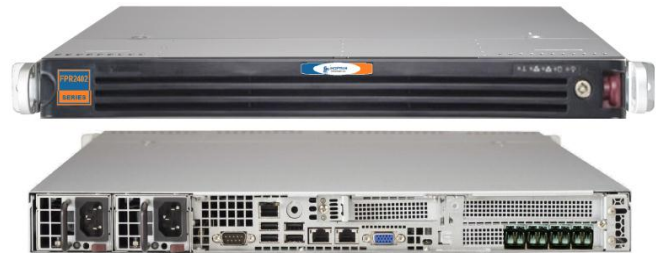
1U Rack mount (*1)

Deploying a FIX Protocol Router solution can significantly reduce both capital and operating expenditures associated with financial trading networks.